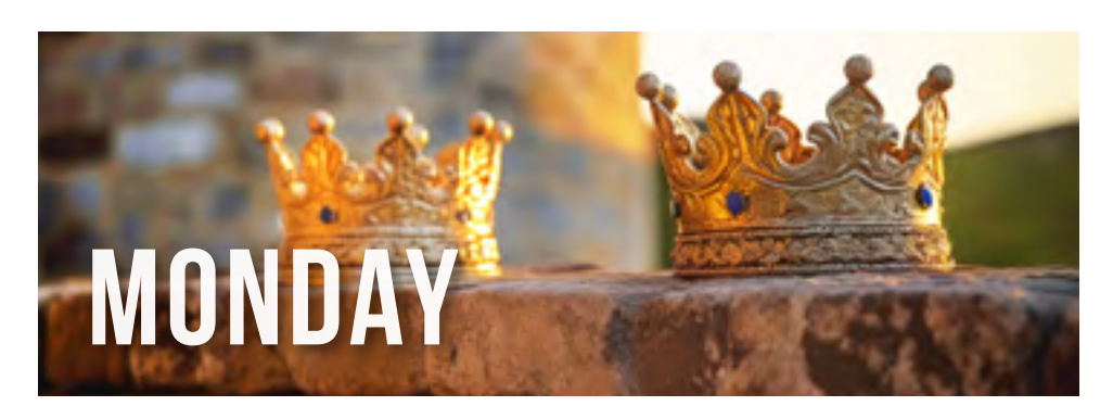
Read 1 Kings 12:21-24; Colossians 3:12-14

Rehoboam, son of King Solomon, became king of Israel after Solomon's death. He was an evil king, leading the people to worship idols and not following the LORD's ways. Therefore, the LORD allowed Jeroboam, formerly one of King Solomon's officials, to lead ten of the twelve tribes of Israel (the northern tribes) to rebel against the king's rule.