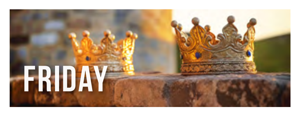
Read Philippians 2:1-11

The theme for this week's devotions is that Christians are not to attack each other. However, the Scriptures have shown us that not attacking one another is incomplete in itself. Much more is necessary. We don't attack; we restore.