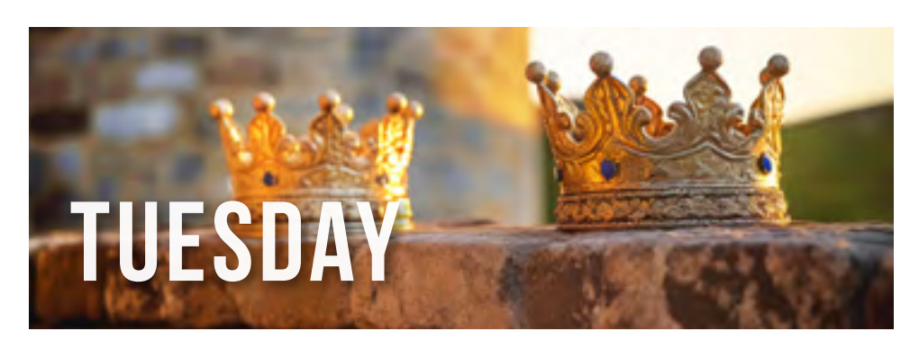
Read Acts 4:32-35; Ephesians 4:7-16

Instead of attacking each other, Christians are called to work together in unity. Then God will bless their labors. God has given spiritual gifts to each of us so that we can work together "so that the body of Christ may be built up until we all reach unity in the faith and in the knowledge of the Son of God and become mature, attaining to the whole measure of the fullness of Christ" (Ephesians 4:12-13). When there is unity among believers, God is able to work in powerful ways through them. In Acts 4:32-35, when "the believers were one in heart and mind," they had great power to preach the gospel.