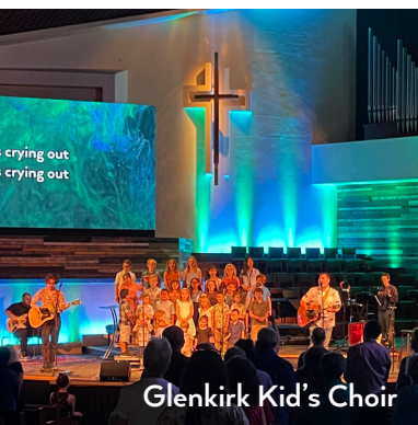
Glenkirk Kid's Choir